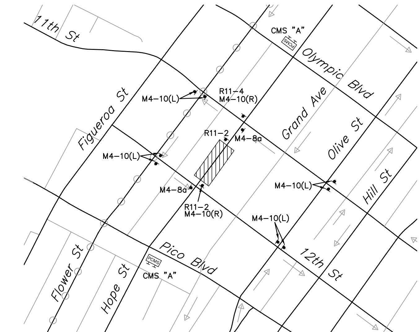
DETOUR MAP NOT TO SCALE